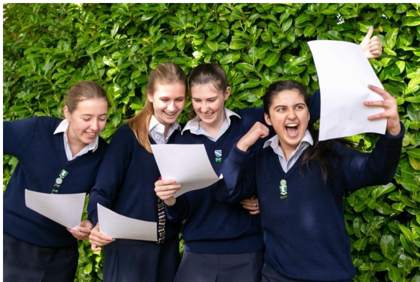
Heathfield students celebrate their GCSE results. Please click here for a high res version.

Heathfield School in Ascot - rated 'Excellent' across all areas by the Independent Schools Inspectorate - is thrilled to be celebrating another year of stellar GCSE results. Across the board, 45% of grades received by Heathfield students were in the top 9-7/A*-A category.